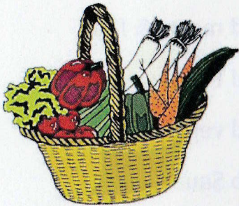
Share your harvest.

Westbrook Food Pantry is located in the Westbrook Community Center